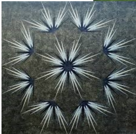
This Years Raffle Quilt: Thistles & Thimbles